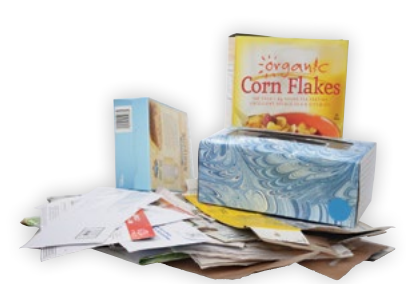
Mixed Paper, Paper Board, Newspaper and Magazines Flatten cardboard and boxes.