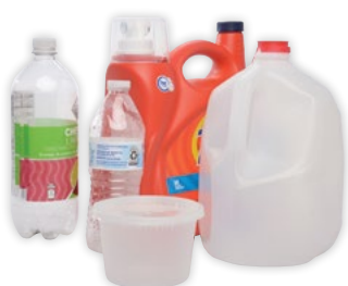
Kitchen, Laundry, Bath Bottles and Containers Empty, rinse and replace cap.